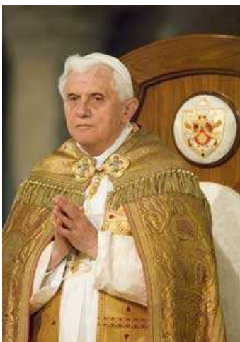
Pope Recalls 'Remarkable Accomplishment' of Father McGivney