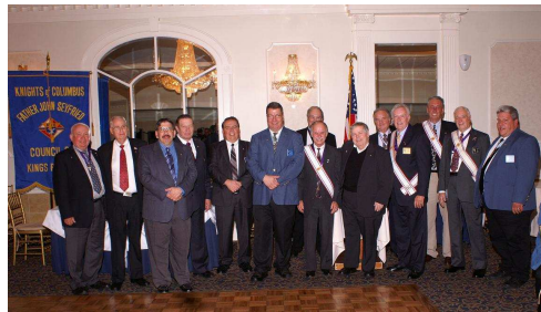
Past Grand Knights Honored at October Gala