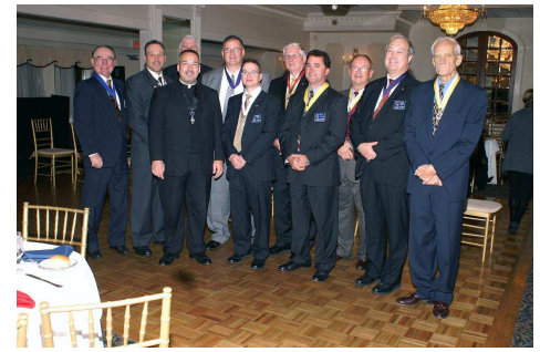
Installed Officers for 2008/2009