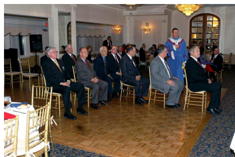
Officers To be Installed at Gala