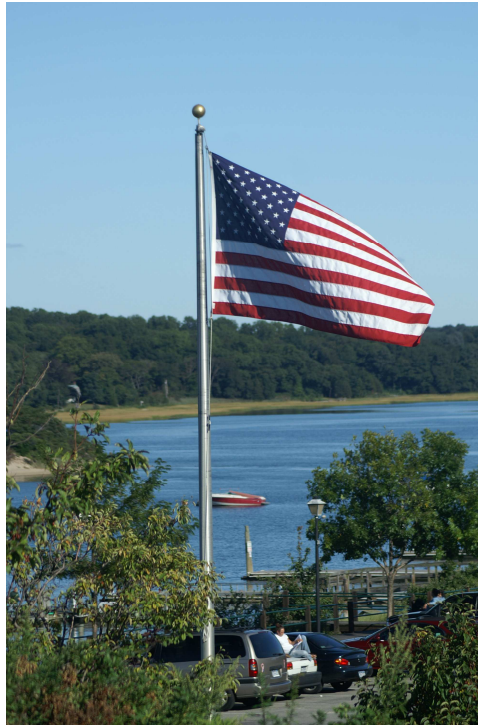
A view from the Kings Park Bluff Site of Thomas Butler Memorial

If we are to celebrate Thanksgiving, let us do it in a manner that reflects giving thanks and that is to assure that the power of the people and especially we Knights, stand by the commitment of protecting life, for each child saved from being aborted, the cry of birth is not only the cry of life but also the cry of thanks. Life issues can be read at a very informative web site, http://www.nrlc.org/ . Go to it and see what is taking place in our nation and around the world on right to life issues. Editor