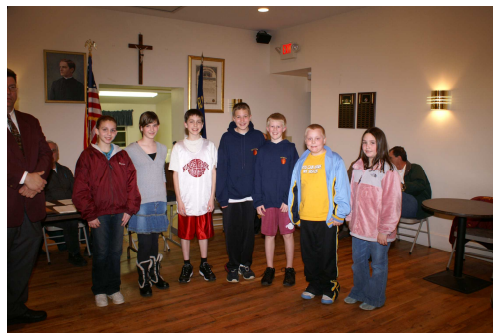
Seven of the advancers to The Free-Throw Contest