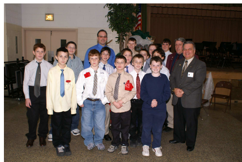
Columbian Squires Investiture