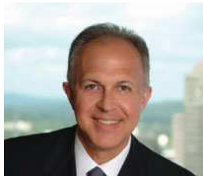
Good news For Catholic Schools

”Much is being made among elected officials here in the United States about the need for bipartisanship, and we couldn't agree more.