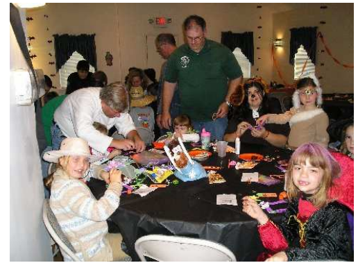
Time out doing some arts & crafts